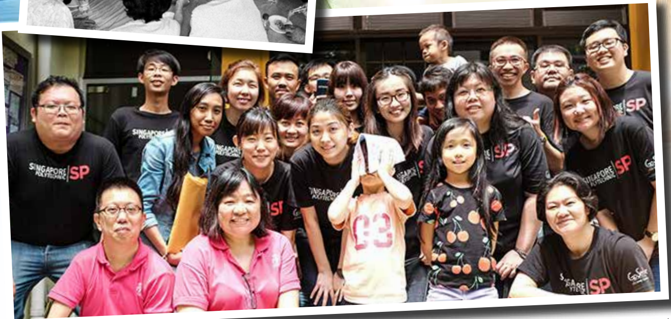
A group photo with the volunteers taken at the end of the event