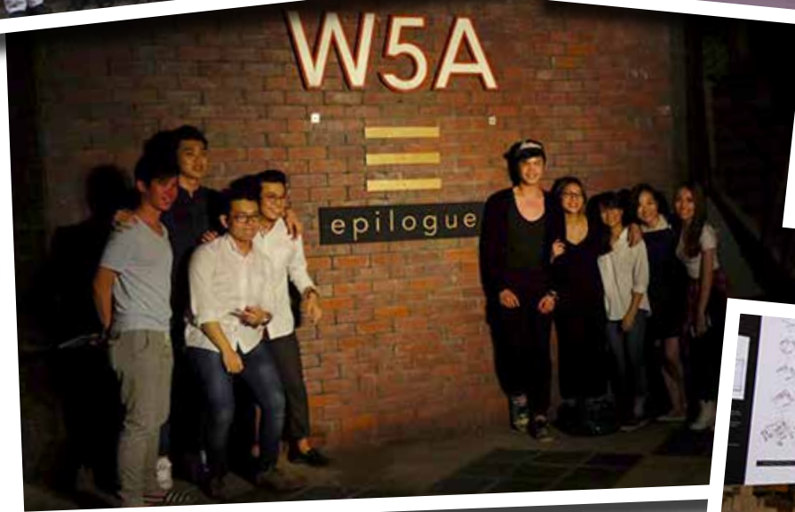
Alumni from various cohorts posing for a group photograph next to the W5A sign, a place which brings back many wonderful memories for ABE alumni