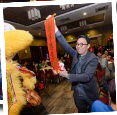
More than 100 SP alumni and staff gathered at the hall to bond over the buffet dinner and entertaining performances