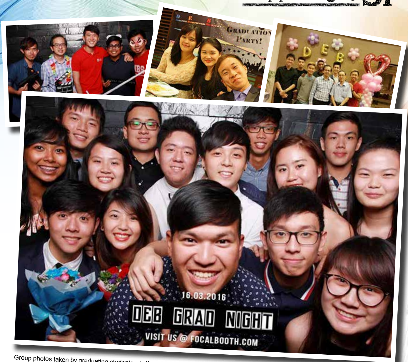
Group photos taken by graduating students, staff and alumni who attended the DEB Graduation Party on 16 March 2016