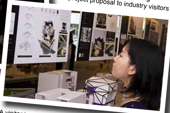
A visitor immersed herself in a Diploma in Architecture Year 3 exhibit