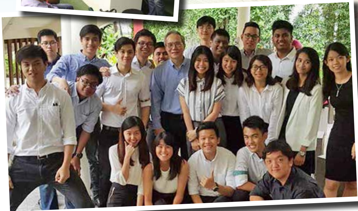
A group photo taken at the inaugural DES day