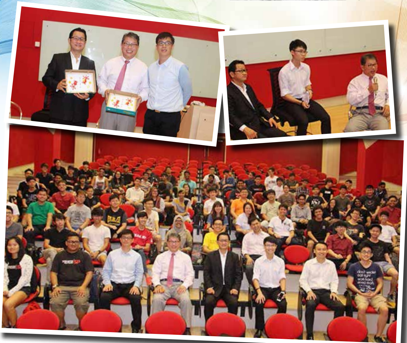
The dialogue session with two successful alumni who inspired more than 120 students