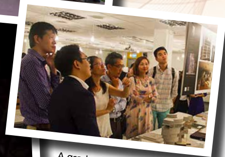
A graduating student explaining his project proposal to industry visitors