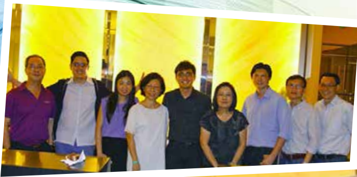
DHLFM graduates gathered for a group photograph with their lecturers