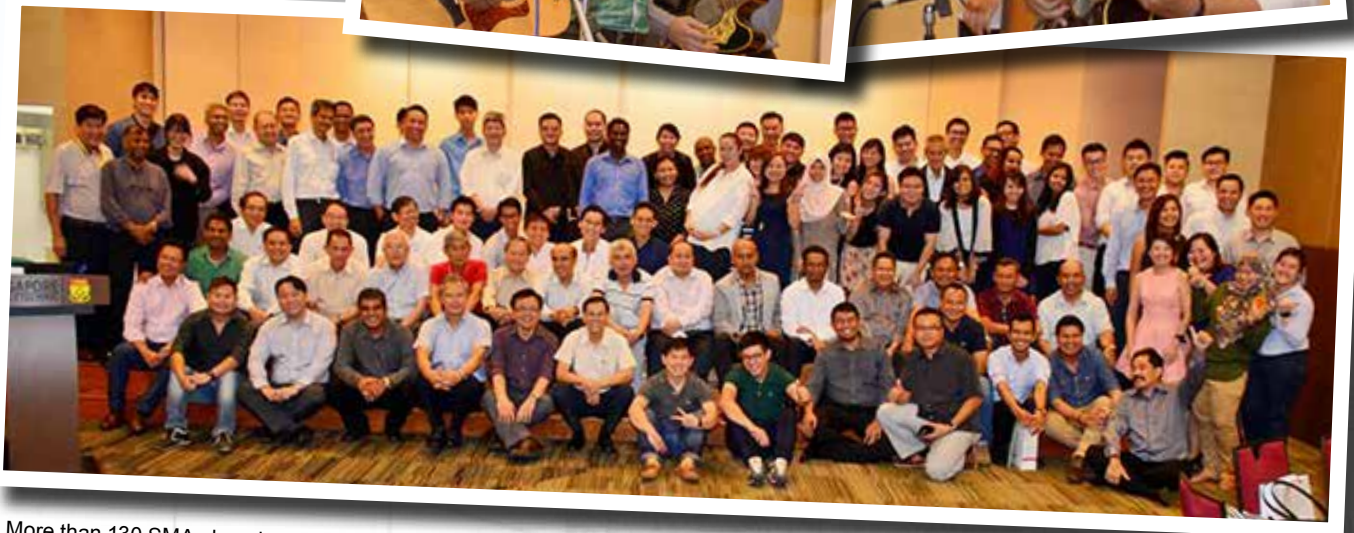
More than 130 SMA alumni attended the homecoming reunion