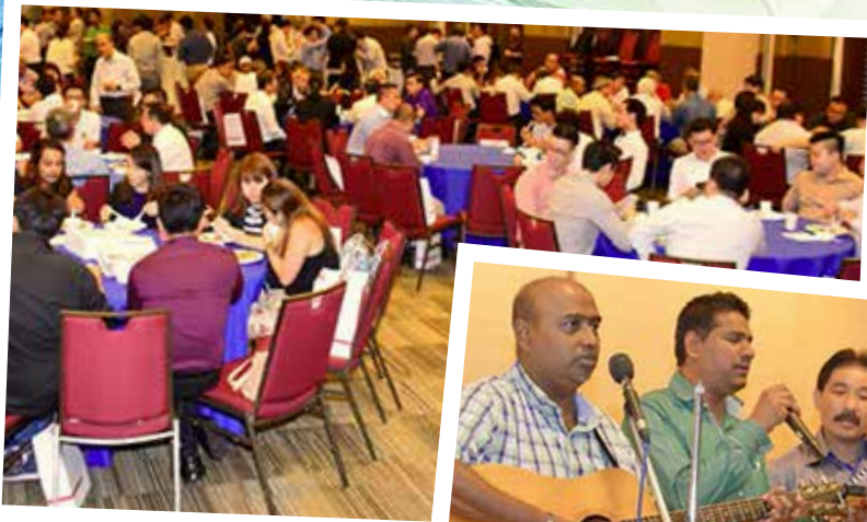
SMA students and lecturers performing at the event