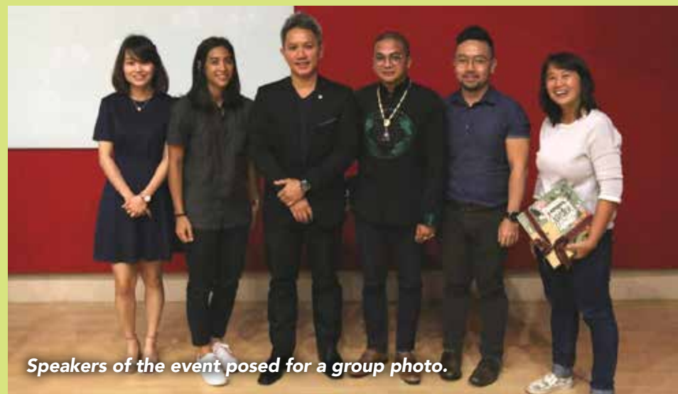
Speakers of the event posed for a group photo.