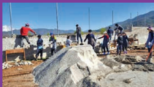
▲ Volunteers helped with cement work to build a wall at the sports field