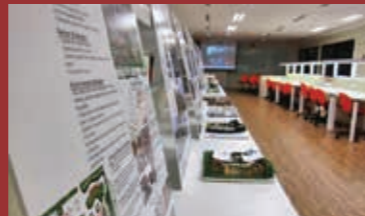
◀ Gallery Walk