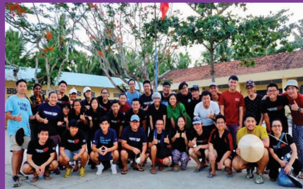
▲ Group photo of volunteers

students, parents and teachers whom had a joyous time. As volunteers also included house visits in their community service programme, they split into four groups to visit the families and provided them with household and food items before having a scrumptious lunch together.