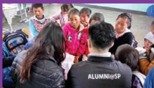
▲ Volunteers reading stories to the children