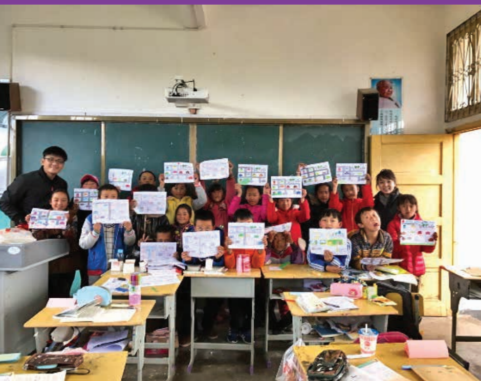
▲ Children are guided to learn directions from the colourful road maps

medical conditions and engaged their families with craftwork. An Easter carnival was also organised by the volunteers to bring joy to the children. Not only did the children have a fun time, the volunteers enjoyed themselves too.