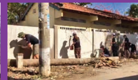
▲ Infrastructure team at work