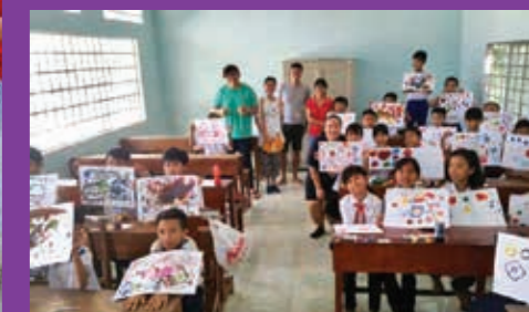
▲ English Language team with students