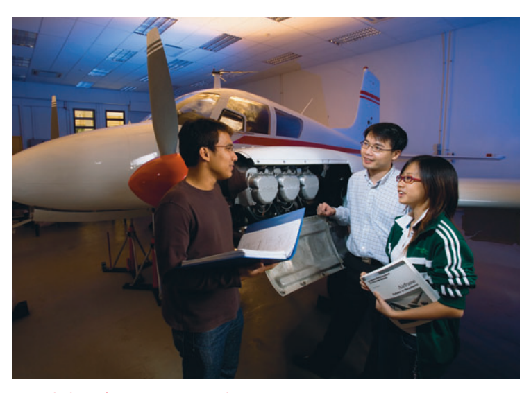
Touch down for a Cessna 310 at the Aeronautical Laboratory.

To enhance the learning experience further, the Aeronautical Laboratory took delivery of a Cessna 310 aircraft and an A4 aircraft engine as teaching aids. Renovation of the new Industrial Project Centre was completed in September 2006.