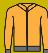
Jacket/ Cardigan (Optional)