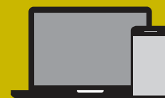
Laptop and/or mobile devices (to access e-learning materials)